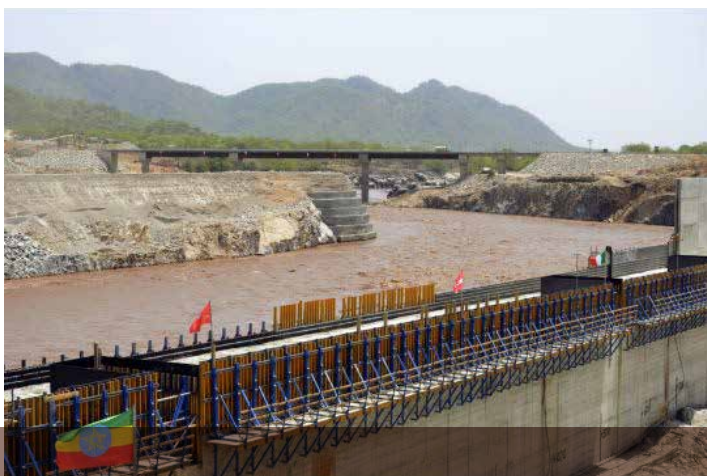
Dam Construction Ethiopia