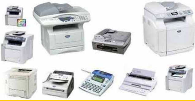
Office Equipment & Supplies