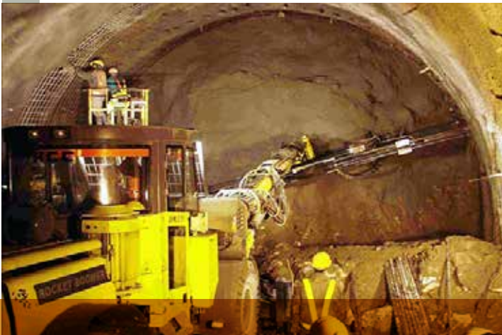
Rail Projects in India