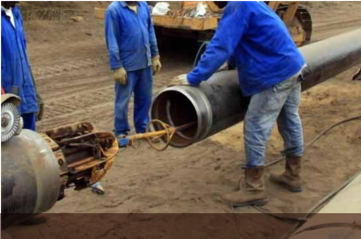
Pipe Line Laying