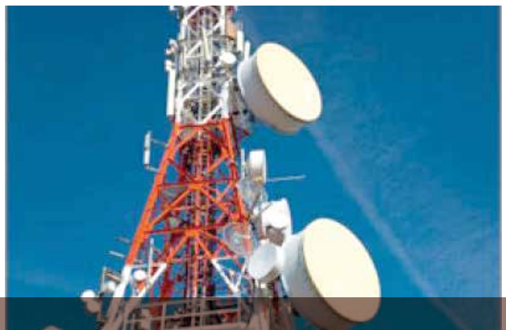
Telecommunication Tower in Ghana