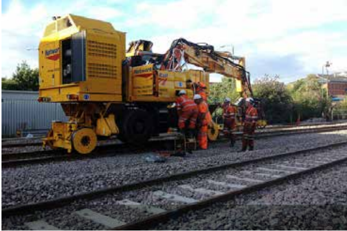
Flash Butt Welding Plant