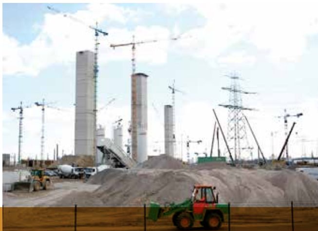
Power Plant Construction, UAE