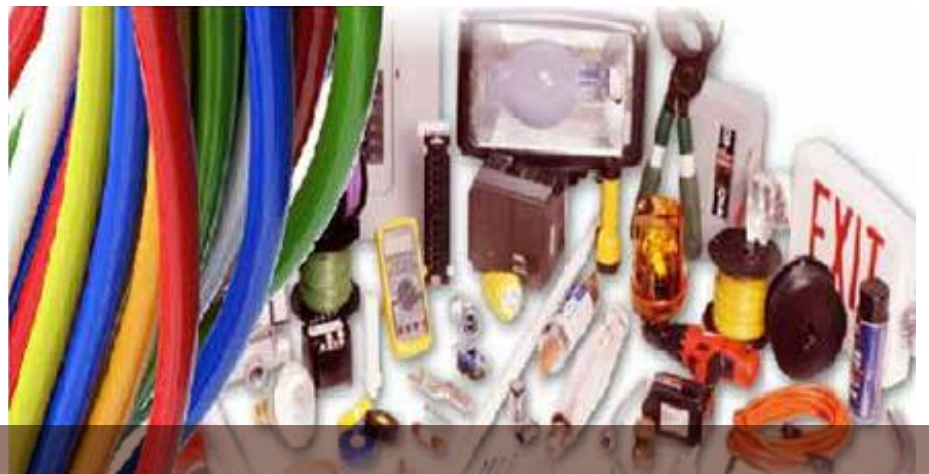
Electrical and Plumbing Supplies