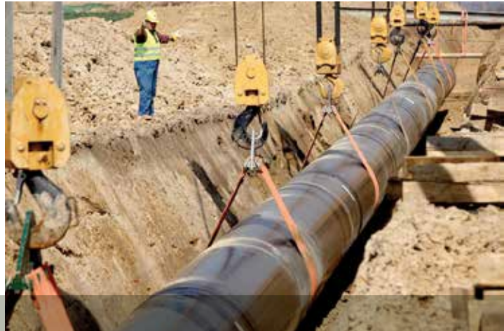
Petroleum Pipeline Works, Oman