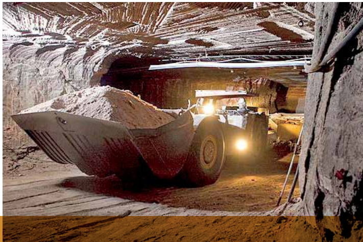
Coal Mining in British Columbia