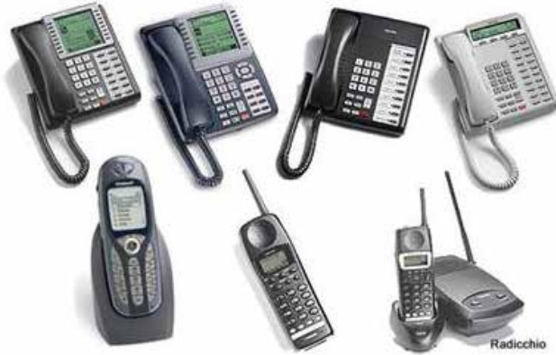
Communication & VTC Equipments