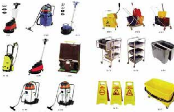
Cleaning & Sanitisation Equipments